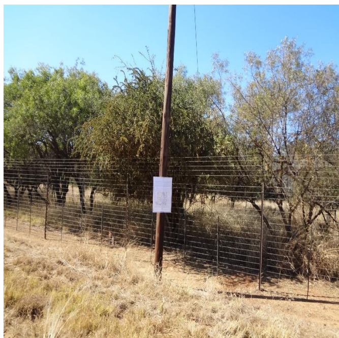
Site Notice 3: Places on Maroela Road Coordinates: 25°38'17.90''S 28°17'43.66''E