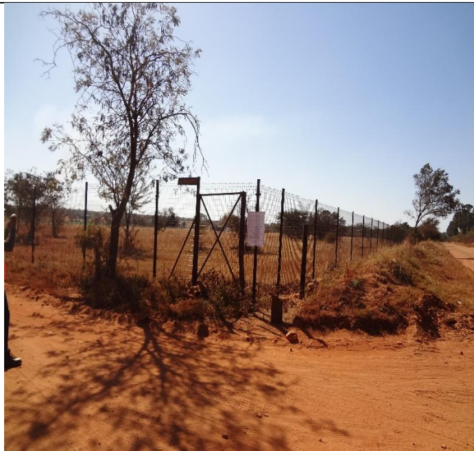
Site Notice 4: Corner of Maroela Road and Lalapalm Road Coordinates: 25°38'44.04''S 28°17'34.11E