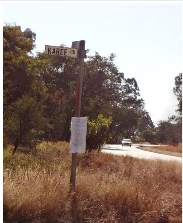
Site Notice 6: Corner of Karee street and Maroela Road Coordinates: 25°39'54.32"S 28°17'28.40"E