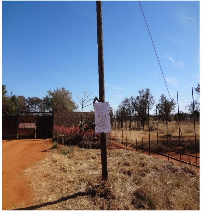
Site Notice 1: Lalapalm Road Coordinates: 25°38'34.99 S 28°17' 17.53"E