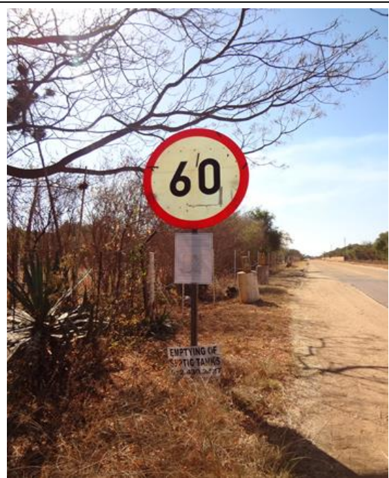
Site Notice 5: Maroela Road Coordinates: 25°39'21.46"S 28°17'25.10"E