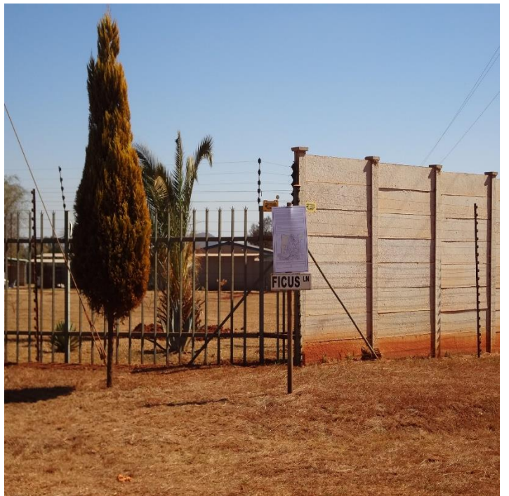
Site Notice 2: Ficus Lane Coordinates: 25°38'42.53"S 28°17'29.65"E