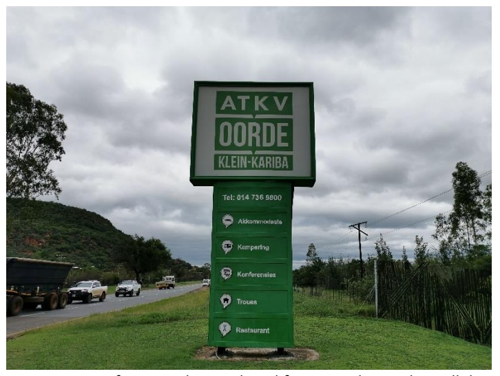
Resorts, game farms and agricultural farms are located parallel to the rural section of the road outside of the road reserve.