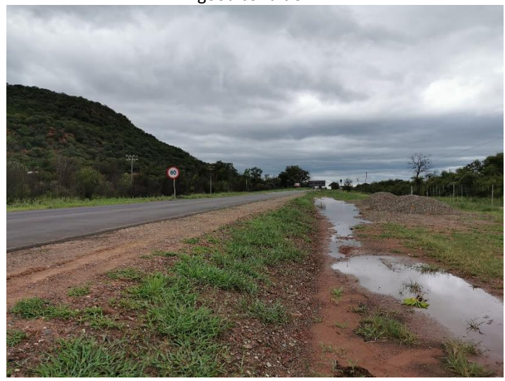
Exiting road servitude consists mainly of gravel shoulders bounded by fences on both sides