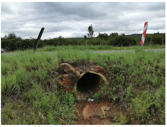
Dilapidated pipe culvert along the road