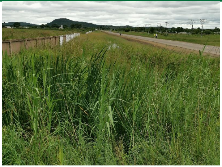
Wetland associated with tributaries of Bad se Loop and Klein Kariba