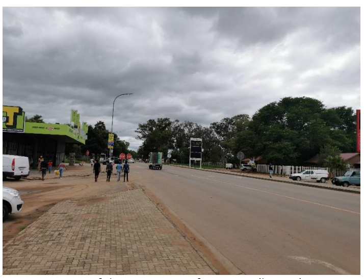
View of the project area from R101 (km 0.0)