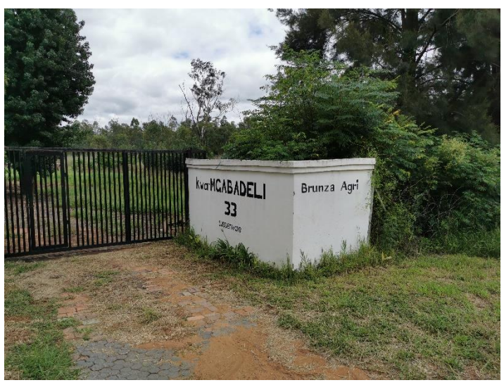
Private properties are located parallel to the road outside of the road reserve