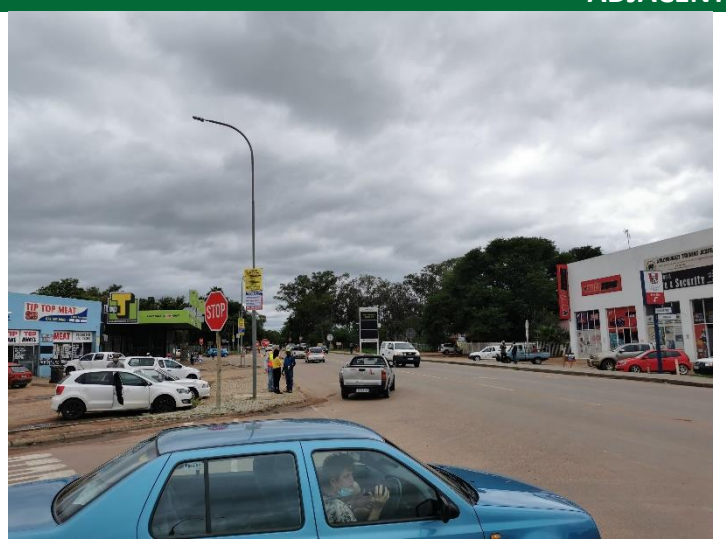
Businesses adjacent to the road in Bela Bela Urban Area