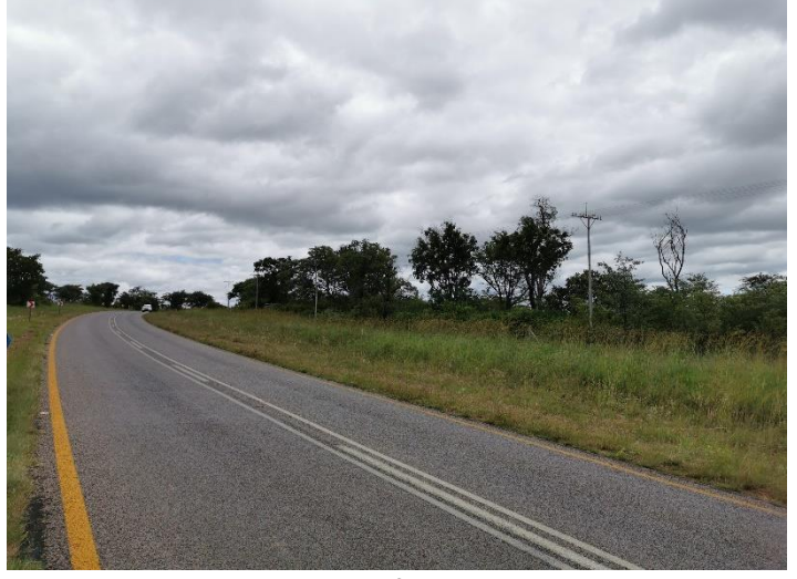
Realignment Area 3 also with a fair to good pavement condition