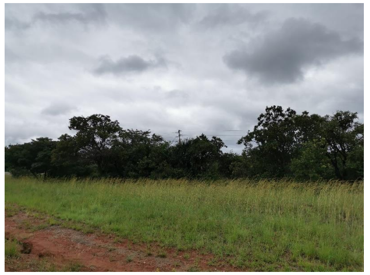
Pristine vegetation at Realignment Area 3