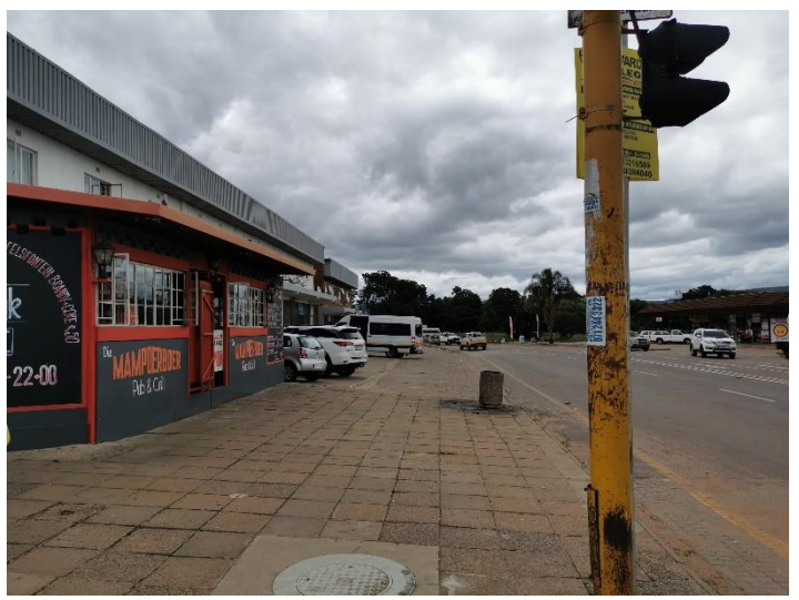
Businesses adjacent to the road in Modimolle Urban Area