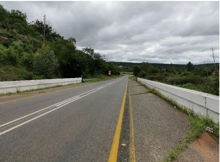
Modderloop Bridge with ageing infrastructure