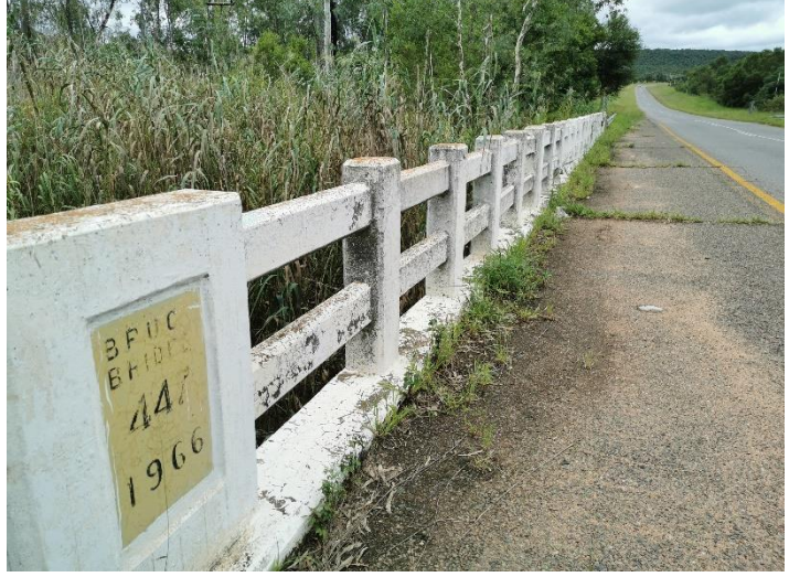
Groot Nyl River Bridge crossing over the critically endangered Groot Nyl River aquatic ecosystem