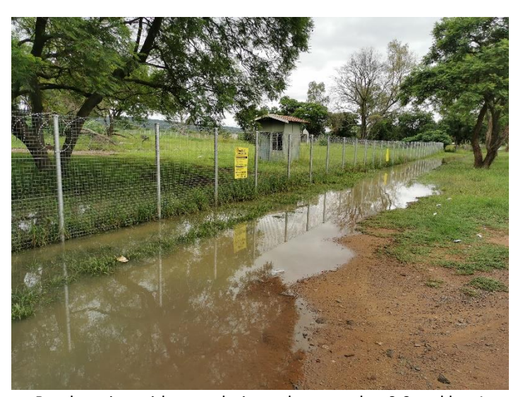
Road section with poor drainage between km 0.0 and km 1 \,