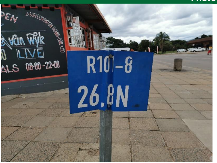
Limit of SANRAL Contract at km 26.8