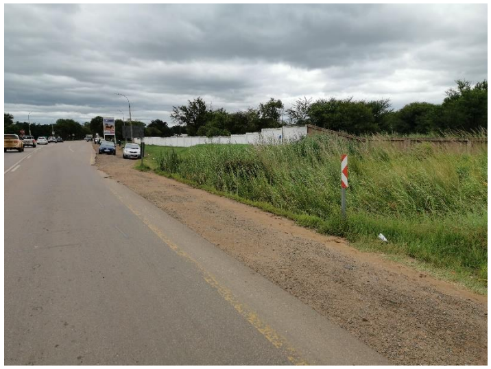
Poorly visible signage along the road to be revamped