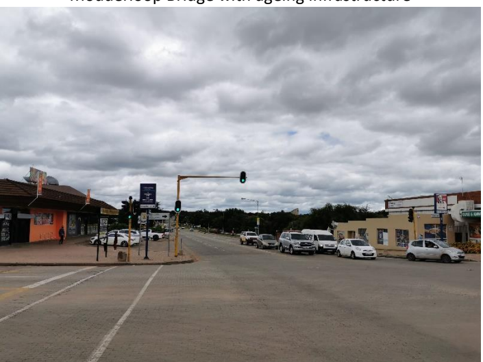
Traffic control infrastructure in Modimolle