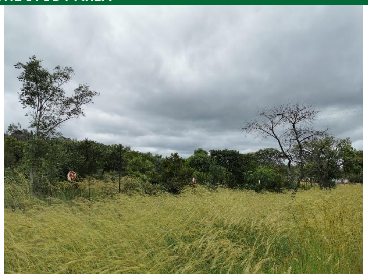
Pristine vegetation at Realignment Area 2