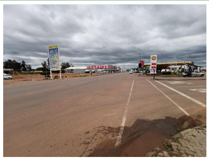
Intersection of the R101 and Voortrekker Road/Chris Hani Drive (km 0.0)