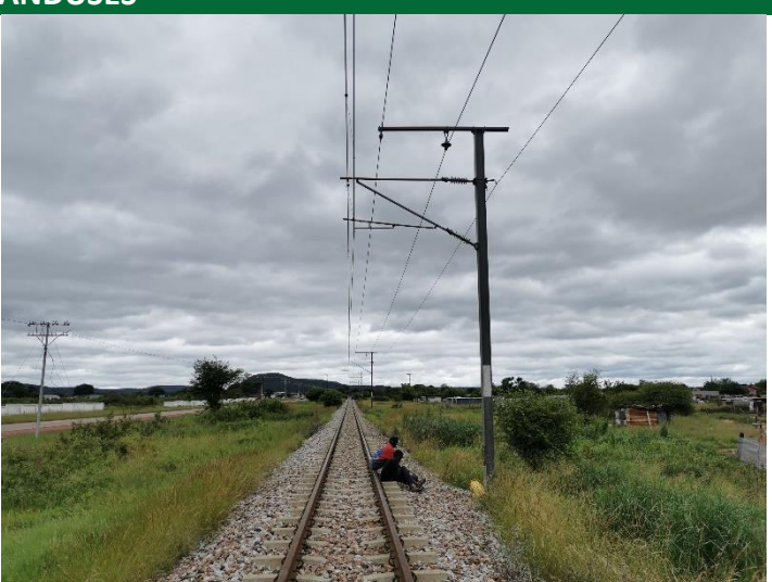
Transet railway line parallel to the road in Bela Bela