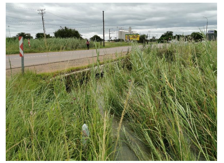
Major box culvert with insufficient drainage capacity