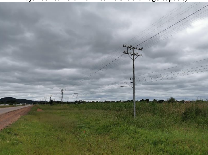
Electrical line parallel to the road in Bela Bela