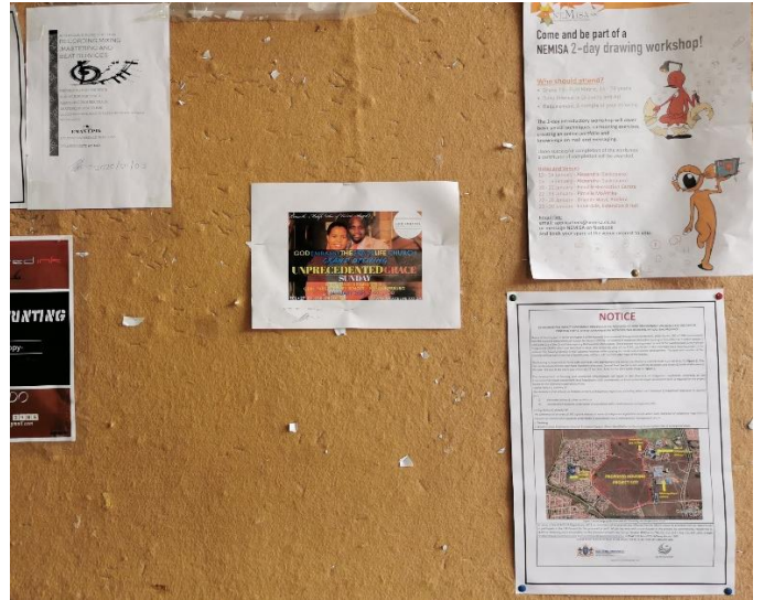
Site Notice 4: Ennerdale Extension 9 Community Library Coordinates: 26°24'13.05"S; 27°49'52.72"E