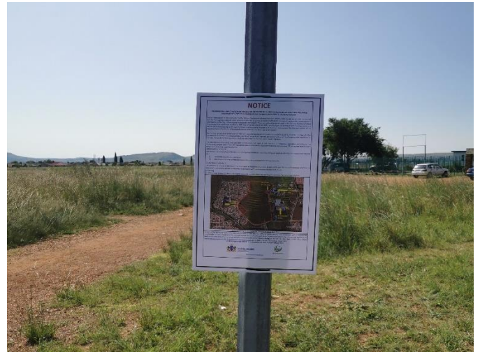
Site Notice 2: Eastern Site Boundary (Street B/Smith Walk) Coordinates: 26°24'14.29''S; 27°49'46.14''E