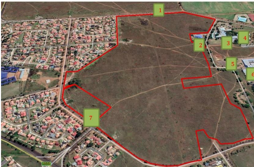
Figure 1: Locations of the placement of site notices