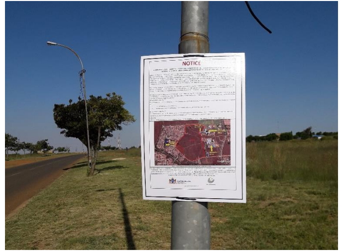
Site Notice 1: Northern Site Boundary (Katz Road) Site Coordinates: 26°24'06.66''S; 27°49'35.25''E