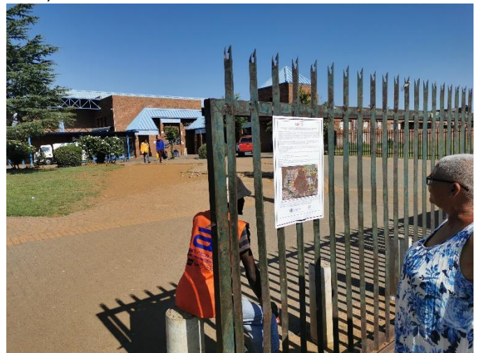
Site Notice 5: Entrance of Ennerdale Shopping Centre Coordinates: 26°24'18.92"S; 27°49'49.31"E