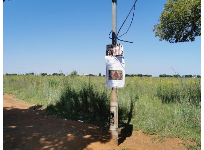
Site Notice 7: Southern Site Boundary (Samuel Road) Coordinates: 26°24'28.42''S; 27°49'81.21''E